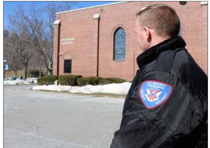
SCCC security keeps an eye on campus.

No student had any major security concerns aside from the shootings that have been occurring around the country.