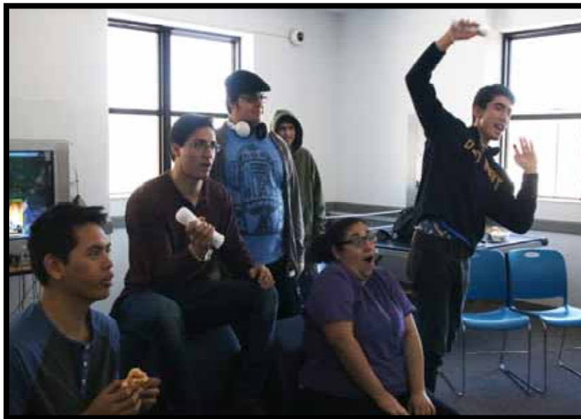
Something's always going on in the Game Room.

The Gamer's Chalice is a club dedicated to playing all types of games and making friends through different activities. The club plays games ranging from video games like Super Smash bros. to Call of