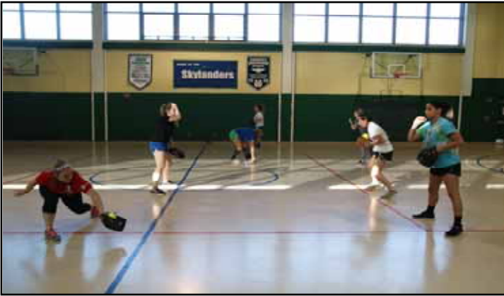
Sussex County Softball Skylanders run practice drills.