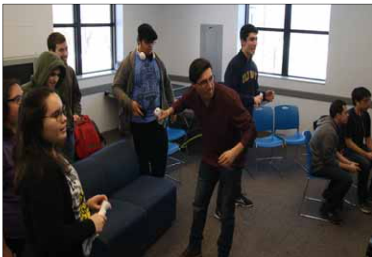
Students Playing Wii Sports Tennis in the Game Room