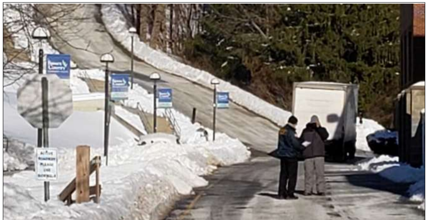
Security personnel and delivery people were about the only ones on campus after second storm.