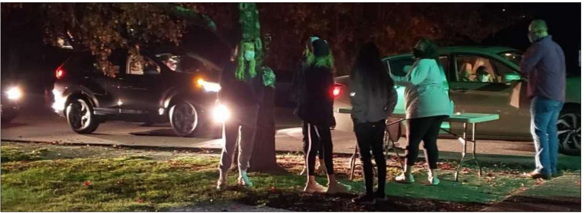
It's takeout for most people, common the time of COVID, with volunteers serving cars that lined up on the road alongside the Green.