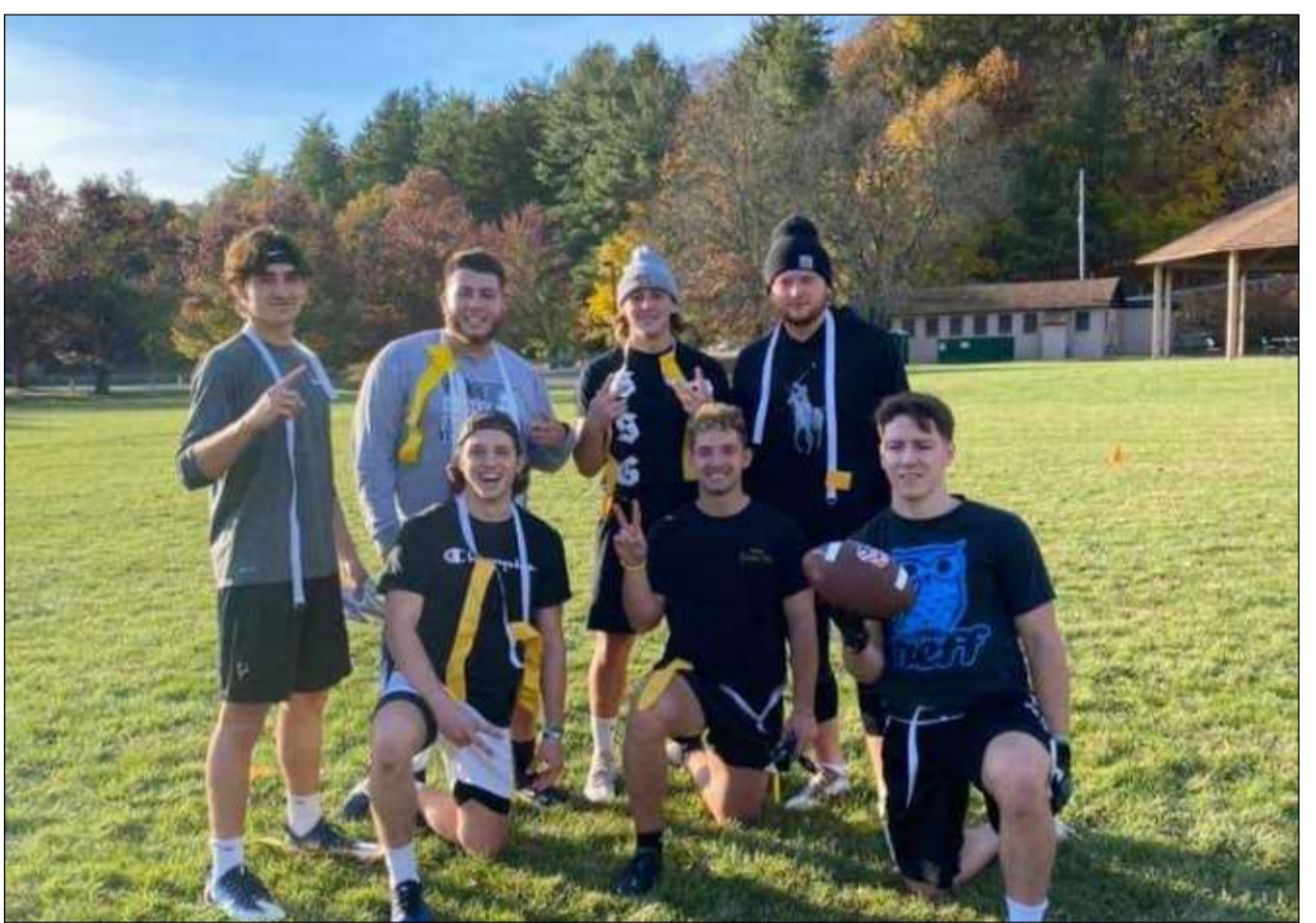
The Monster Bowl, in which these students played, was but one of the events throughout the semester of COVID.

She said they decided for Fall 2021 to host three flag