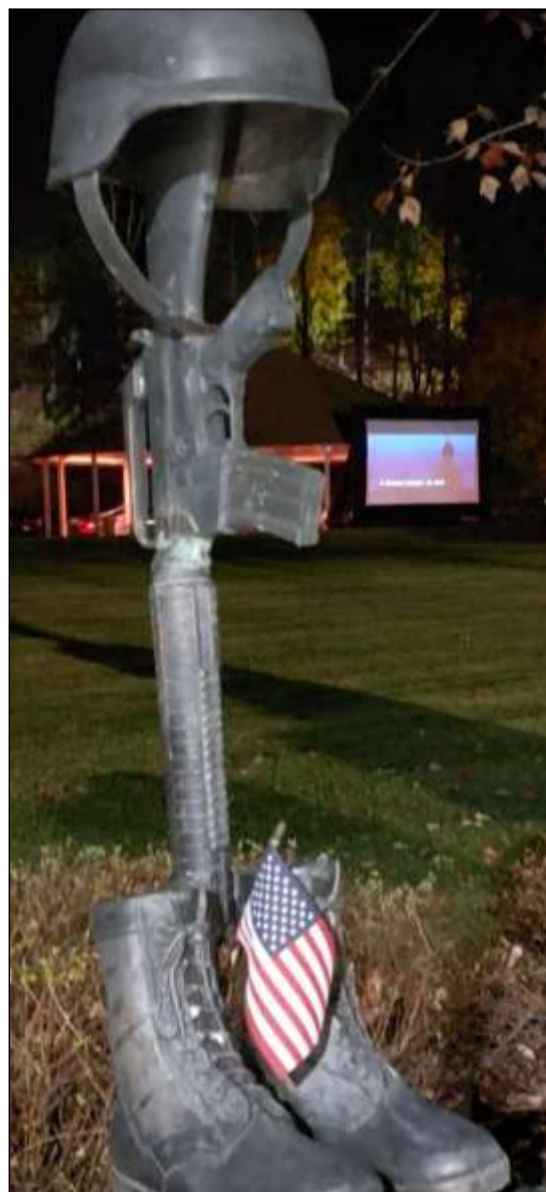
Movie also showed on reverse side of screen.