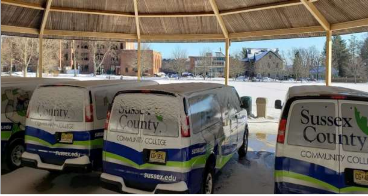
During the Dec. 17 storm, the gazebo on Connor Green served as a parking garage for several college vehicles.