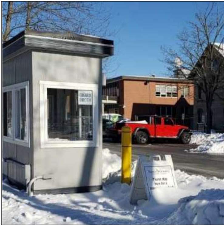
After the second storm, there wasn't much checking of temperatures at the guard shack.