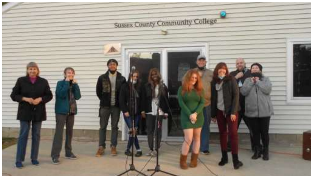
Students came to both perform and listen at the Studio 20 Open Mic event.

people were able to make it to the open mic, and even fewer wanted to participate. But those who did, did so fantastically. The crowd numbered about 15 people that afternoon.