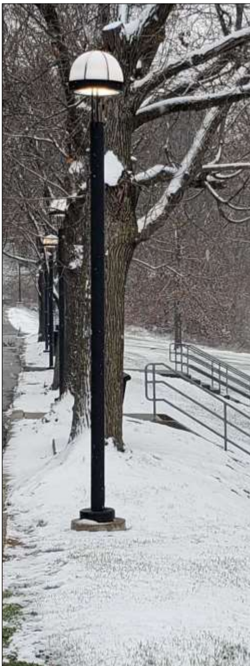
By late afternoon, the lights were on.