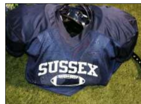
A jersey with shoulder pads.

No doubt there is great excitement that sports are back in our community and for our students to enjoy in a different type of fashion. With each team getting extended time to practice and build chemistry students can’t wait to see how well SCCC does in the spring seasons.