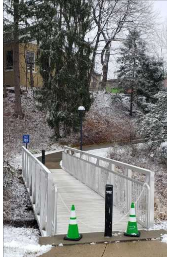
The bridge and walkway up the hill from the parking lot looked pretty much the same after both snowfalls, as facilities workers kept it cleared.