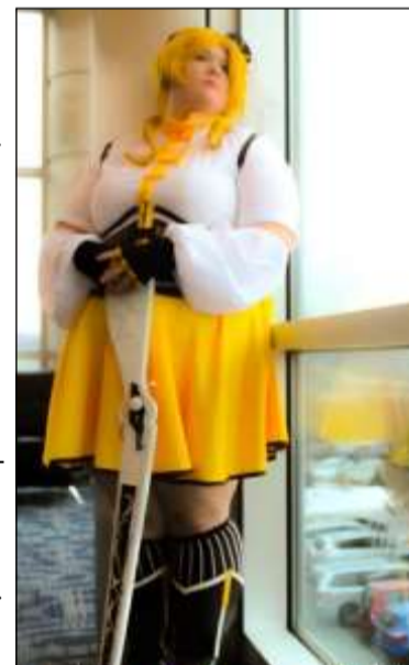
The writer as Sally Slater.

Painting over a pair of old shoes with a light pink fabric paint and sewing on ribbons to tie them to my feet was the best way to achieve a different style of shoe. The same with the parasol, I painted it the same shade of pink and added lace to the edges along with brown paint for the handle and tip.