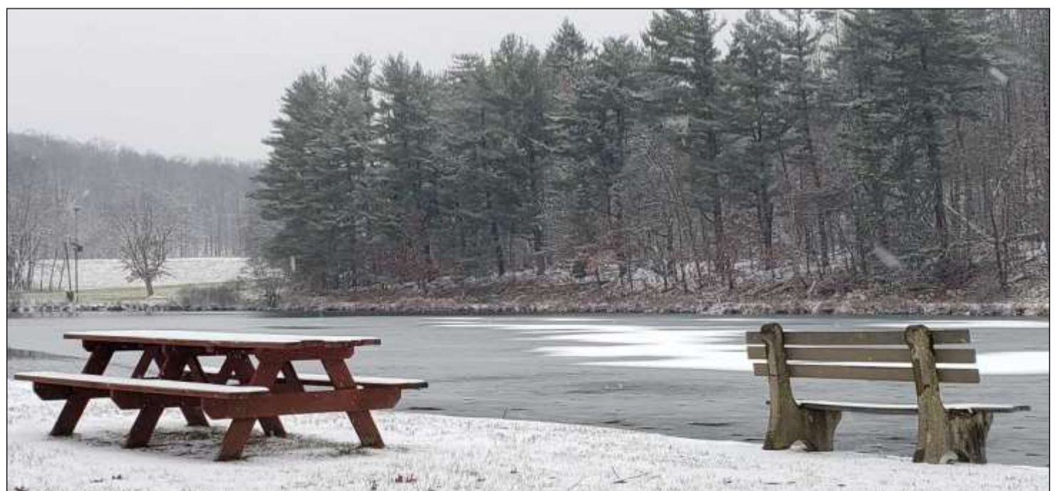
The pond looked like a nice place to sit and think after the first snowfall, but only if one brushed off the seats.