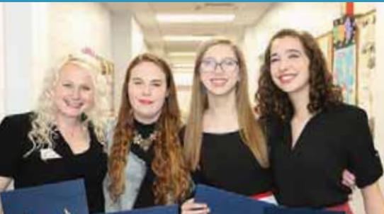
Students are proud of their Leadership Award