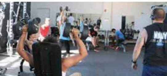
Finding time to work out in the new Fitness Center

A new 3000 sq. ft. Fitness Center opened provides a great space for students to stay active and socialize.