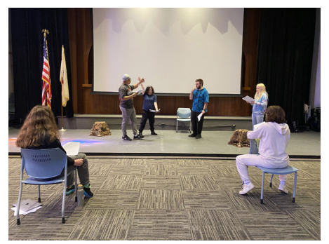
Children's Play "Once a Pond a Time" rehearsal

Delfino discussed why it's a good thing to take children out to see live theater. Some of the benefits included supporting the growth of knowledge