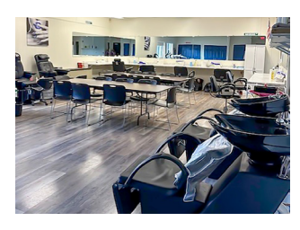
New Cosmetology Facility