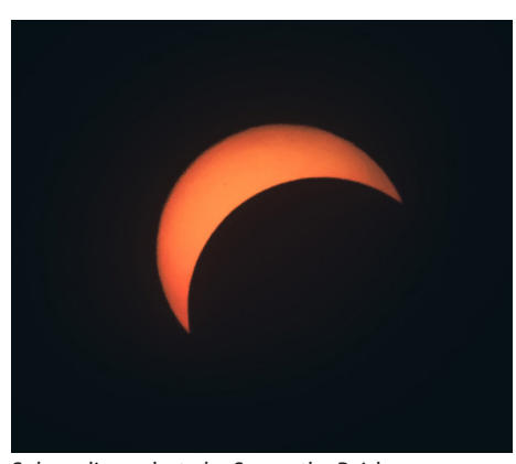
Solar eclipse photo by Samantha Baisley

The eclipse began around 2 p.m. and lasted until 4 p.m., with the best viewing occurring between 2:30 p.m. and 3:20 p.m. The visibility was phenomenal until about 3:20 p.m., when the sky became too cloudy to see the eclipse as clearly, with viewers only getting glimpses through the clouds.