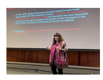
Learning Rocks Through Time