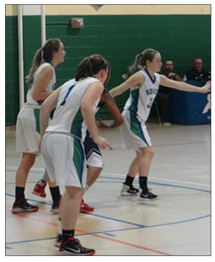
Distance Learning Site – All students enrolled in online and blended (hybrid) classes will use this site for communication with instructors.

Pay Online and E-refund – Students are encouraged to pay tuition online with their student assigned ID and password. There is an interest-free payment plan for the spring and fall semesters. E-refund offers a convenient way for students to receive electronic refund checks bak into their bank account.