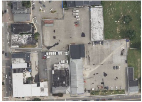
MTEC 41-47 Main St. Newton, NJ