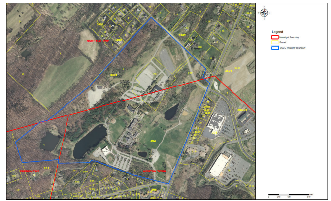
Main Campus 1 College Hill Rd. Newton, NJ